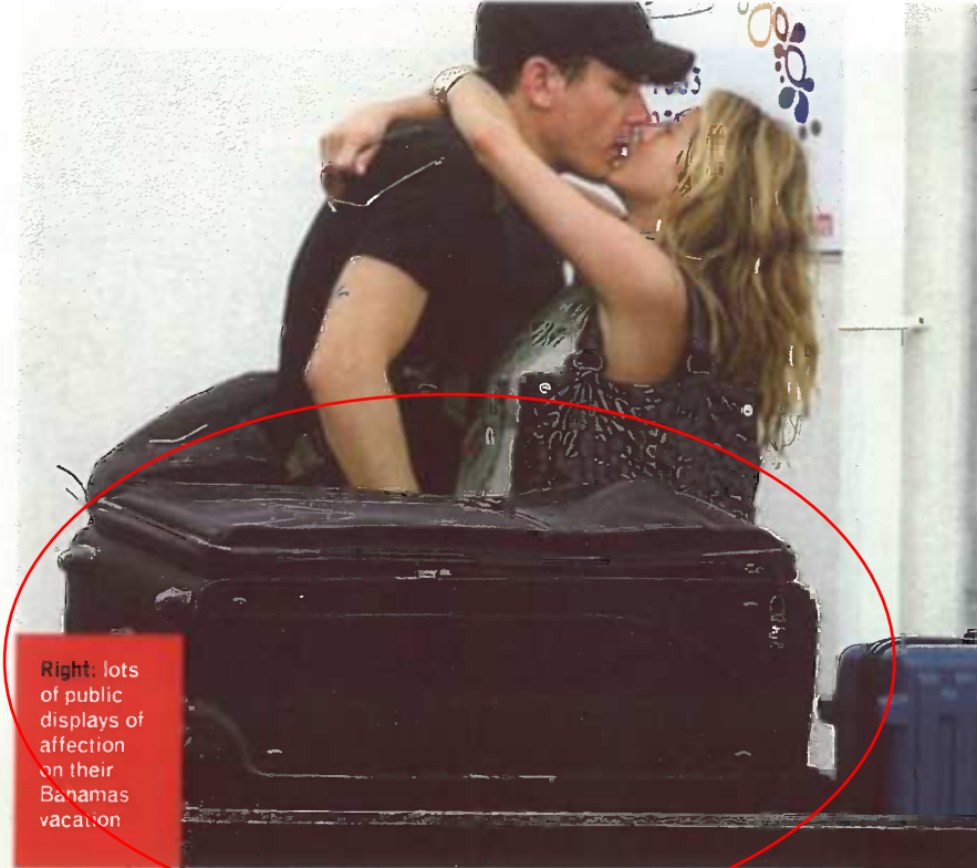
Right: lots of public displays of affection on their Bahamas vacation