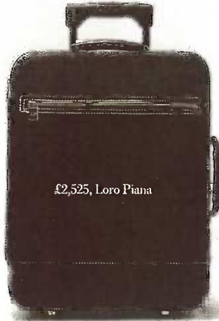
£2,525, Loro Piana