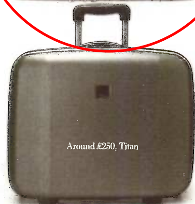
Around £250, Titan