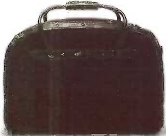
£205, Vintage by Samsonite Black Label