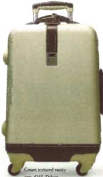
Cream textured vanity case, £115, Delsey