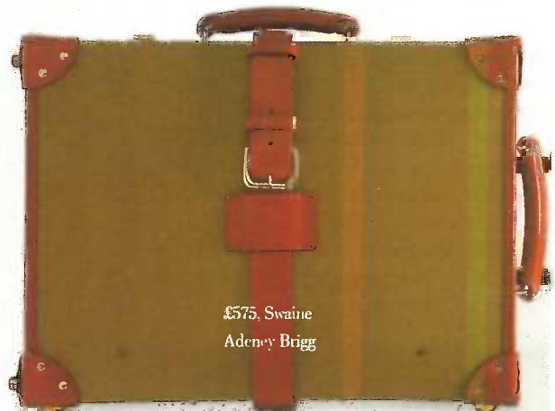
£575, Swaine Adeney Brigg