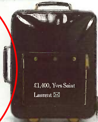
£1,400, Yves Saint Laurent