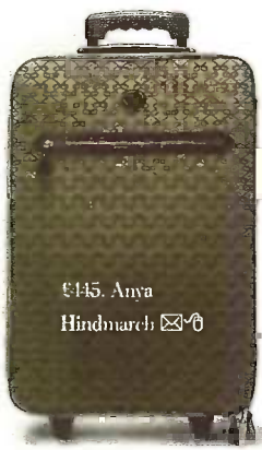
£145. Anya Hindmarch