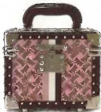
£151, Juicy Couture