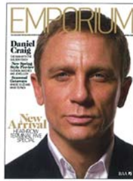
On The Cover Daniel Craig