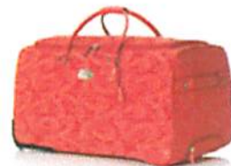
JASPER CONRAN FOR TRIPP (0845) 345 6095