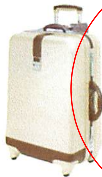
DELSEY (020) 8741 5000