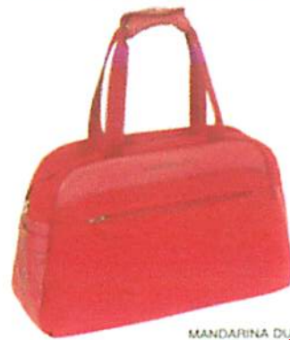
MANDARINA DUCK (0113) 362 2400