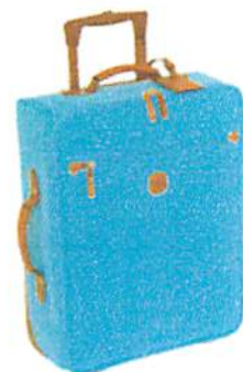
BRICS (0115) 369 8040