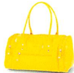
BETTY BARCLAY (0161) 452 0058