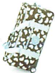
KIPLING (020) 7299 9990