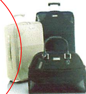
JOHN ROCHA FOR TRIPP (0845) 345 6095