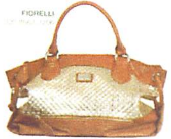
FIGRELLI 020 7342 1234