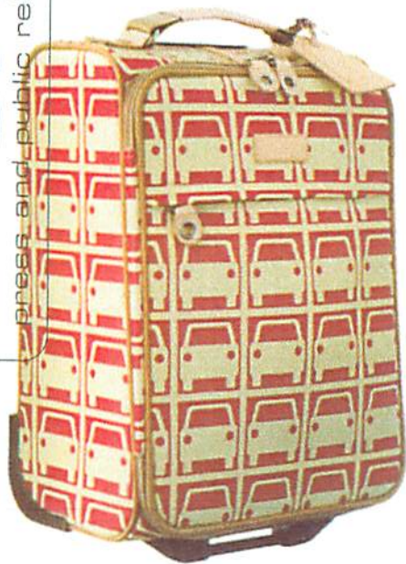
ORLA KIELY 02000 141 549 (UK) 1 800