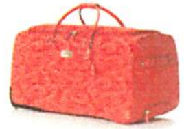
JASPER CONRAN FOR TRIPP 020 7461 4200