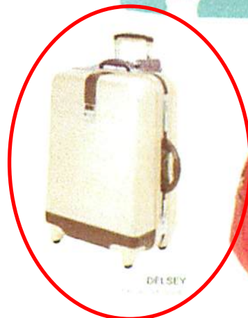
DELSEY 020 7461 4200