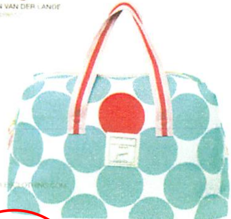
JOULES 02000 141 549 (UK) 1 800

Practical or pretty, muted or metallic, wildly patterned or posh plain, they're all out there in big bags and small bags, suitcases and trolleys.