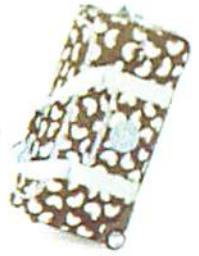
KIPLING 01753 60001