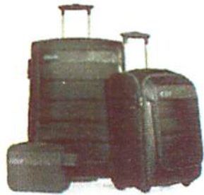
ANTLER 020 7461 4200