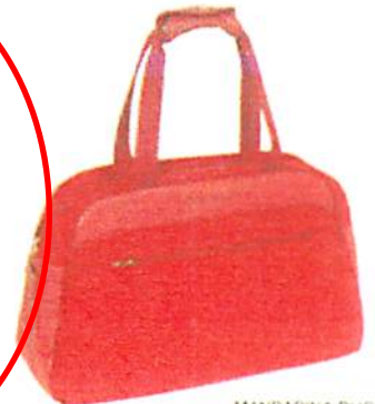
MANDARINA DUCK 020 7461 4200