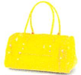
BETTY BARCLAY 01753 60001