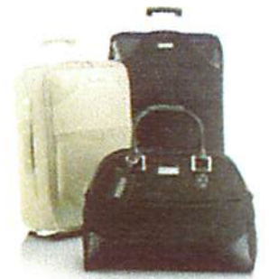
JOHN ROCHA FOR TRIPP 020 7461 4200