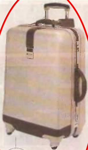
Delsey's 1930s style Carisma bag Price: £335 www.delsey.com With heavy hard shell case and traditional toe leather trim. Perfect for that stately lausanne cruise.