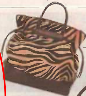
Tura's bengal tiger print holdall Price: £545 www.tura.com For the glamorous safari.